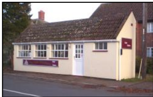
NOW, The Cat's Whiskers