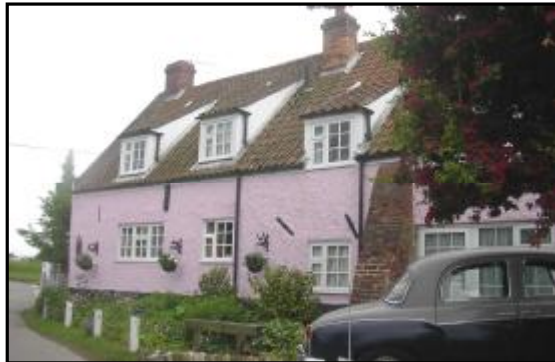
NOW, Malthouse Farmhouse