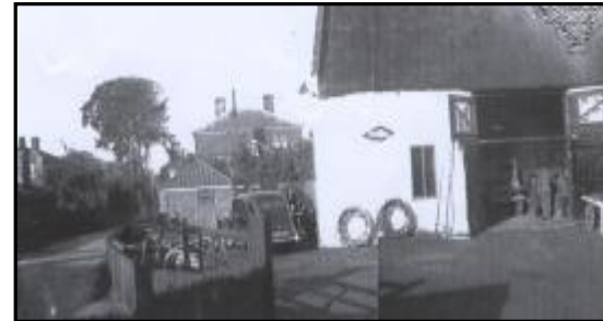
THEN, Rear of Albury House, 1950's