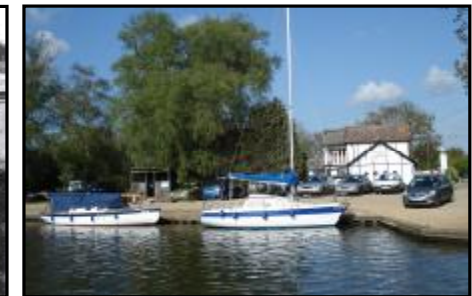
NOW, Ludham Bridge Shop