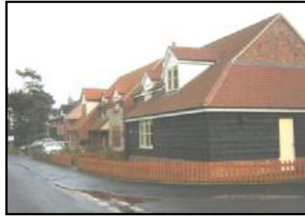
NOW, Three Houses