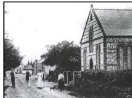
The Methodist Chapel, Hight St. in 1867 THEN