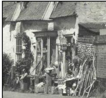
THEN, Knacky Knight's Shop