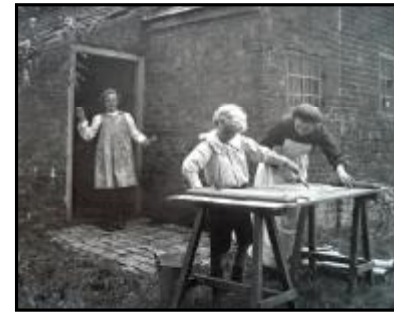
THEN, Toad Hole Cottage