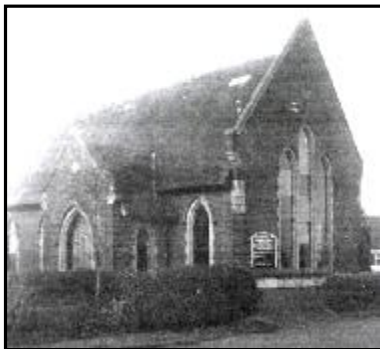
THEN, Johnson St. Chapel