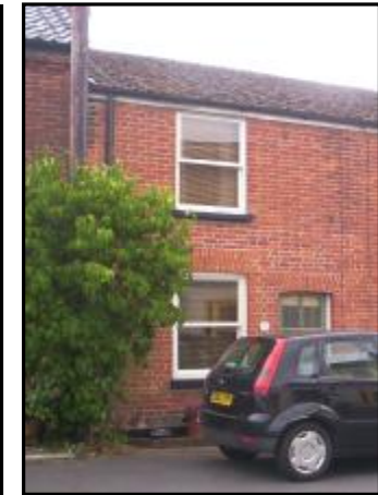
The Drug Store on Stocks Hill