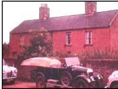
The Street, THEN