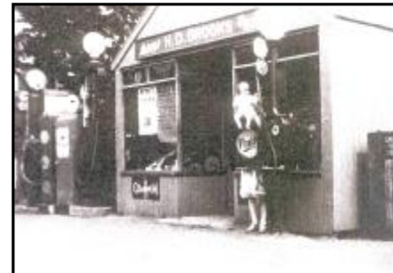
THEN, Brooks's Garage on Catfield Road