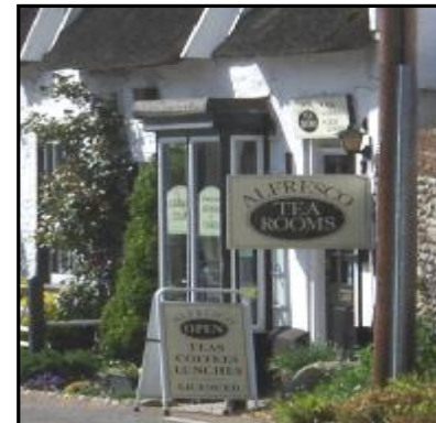
NOW, Alfresco Tearoom