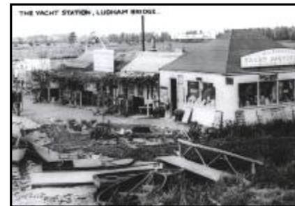
THEN, Parkinson's Shop