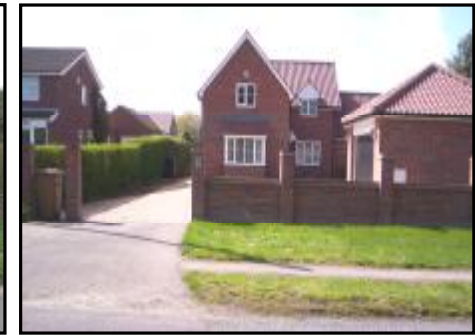
NOW, Et Tare