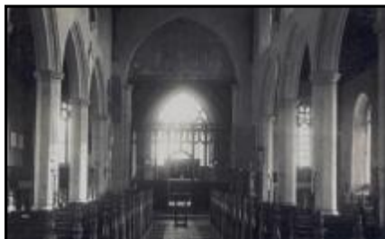
THEN, Ludham Church (interior)