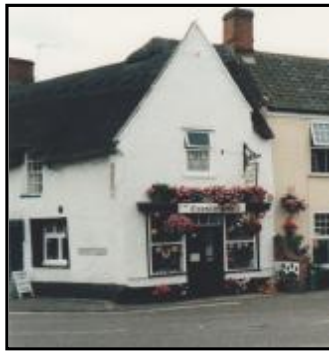
THEN Corner Cabin as a shop