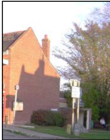
NOW, Baker's Arms Green