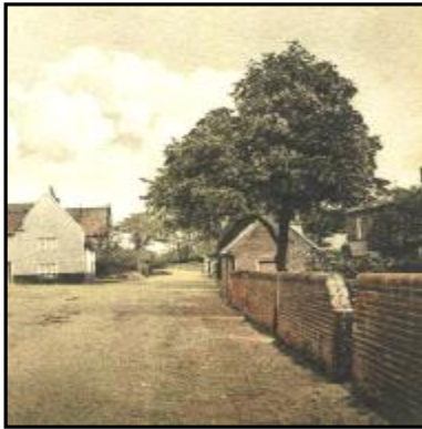
The Street, THEN