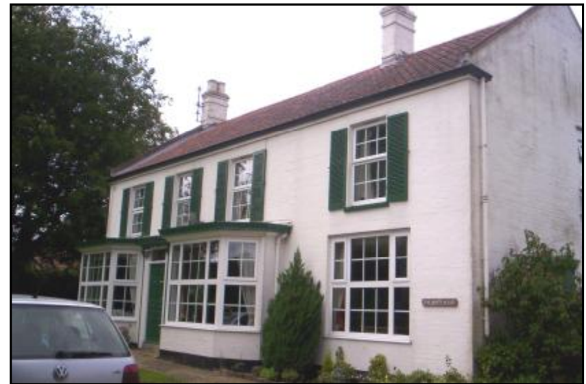
NOW, The White House