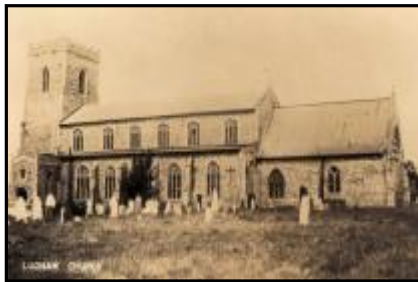
THEN, Ludham Church (rear view)