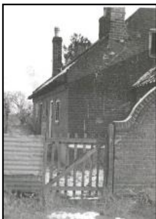
THEN, Three cottages