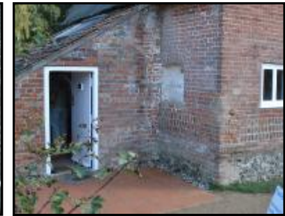
and NOW, a museum