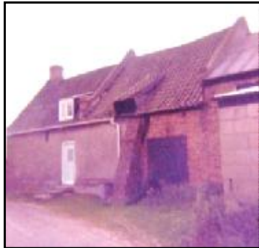
THEN, Malthouse Barn