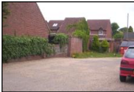
NOW, Thrower's car park