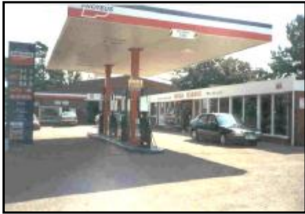
THEN, Roll's Garage