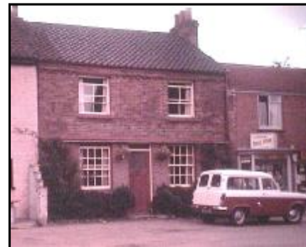
Bob's Cottage, Stocks Hill THEN