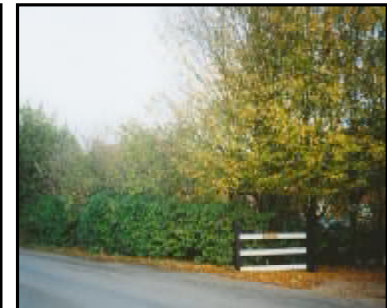
and NOW .....