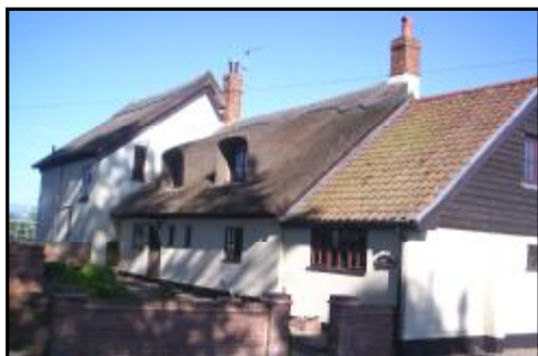
NOW, Hall Common Cottage