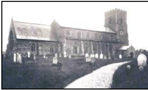
THEN, Ludham Church (front view)