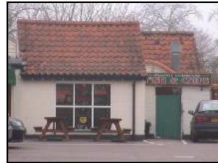
THEN, Planet Codwood, fish and chip shop