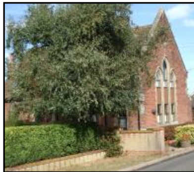
NOW, a residence