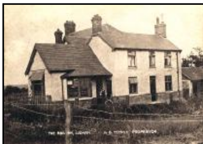
The Dog Inn, THEN and NOW