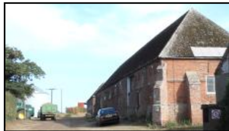
The Great Barn at Ludham Hall