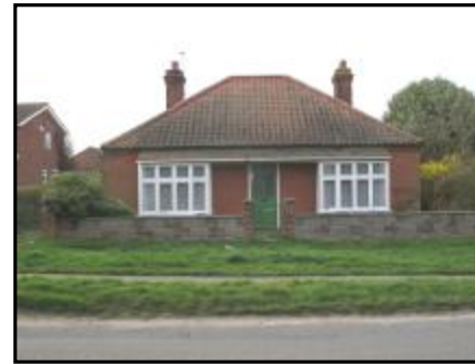
THEN, Myholme, Catfield Road