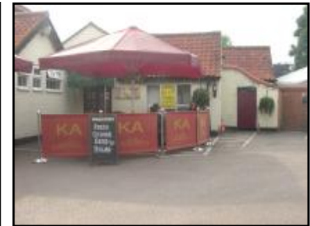
NOW, King's Arms car park and smoking area