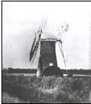
Beaumont's Mill THEN