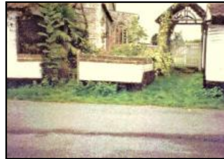
THEN, Lych Gate (front view)