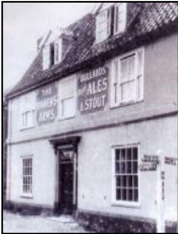
THEN, Baker's Arms