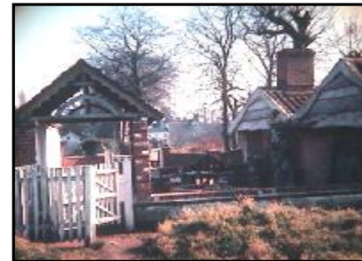
THEN, Lych Gate (rear view)