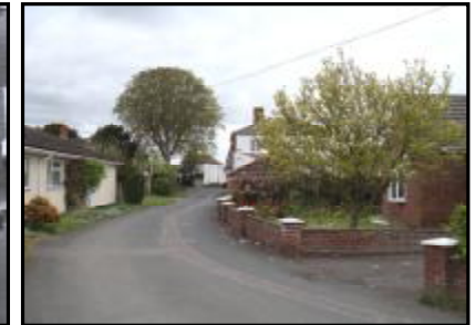
NOW, Malthouse Bend