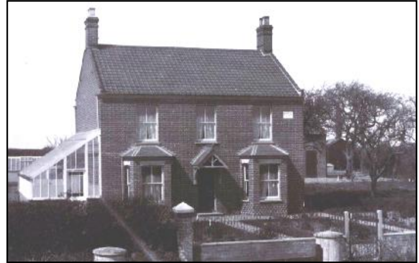
THEN, Womack View in Staithe Road