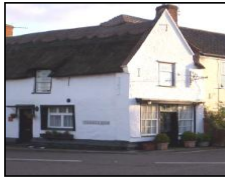
and NOW as a residence