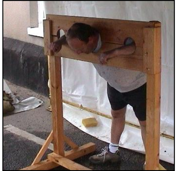
WHAT DID I DO ?