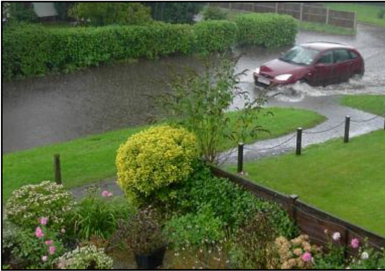
THAT BLOODY SAT-NAV'S DONE IT AGAIN