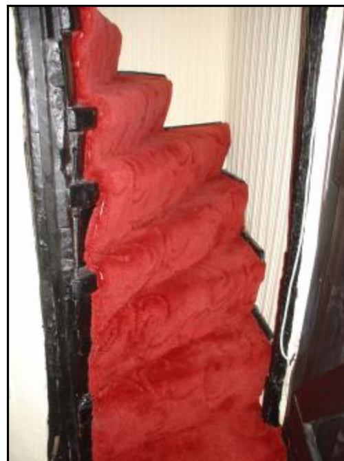
IT'S YOUR FEET THAT ARE TOO BIG !