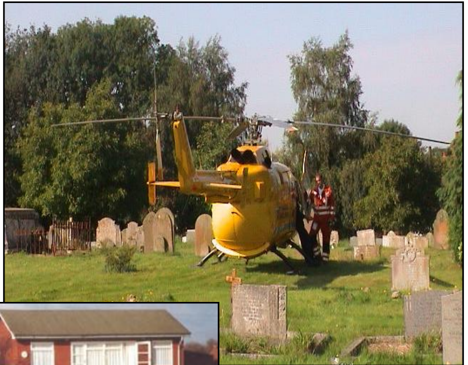
I DON'T THINK THIS IS THE RIGHT LANDING SITE !