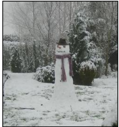
OH YES, I'VE LIVED IN LUDHAM ALL MY LIFE, 3 HOURS