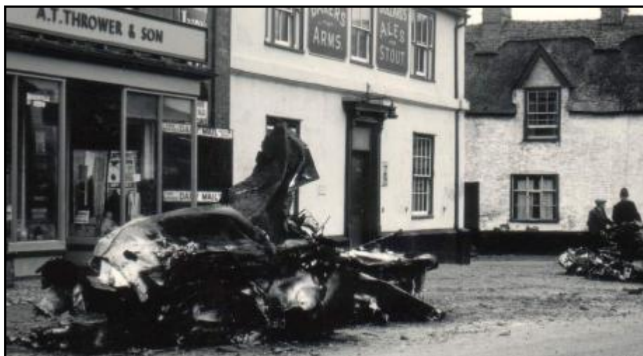
HE DIDN'T SEE THE NO PARKING SIGN, I GUESS