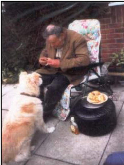
ONE FOR ME, ONE FOR YOU