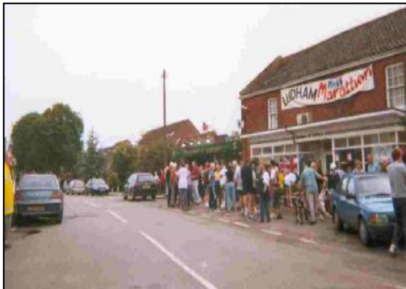
JUST HEARD! THROWERS HAVE GOT A HALF-PRICE SALE