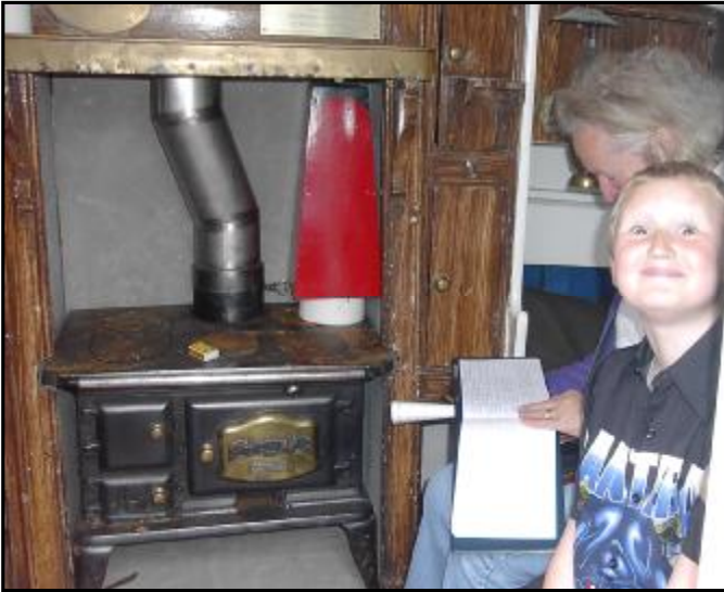
DID SOMEONE MENTION CREAM CAKES ?