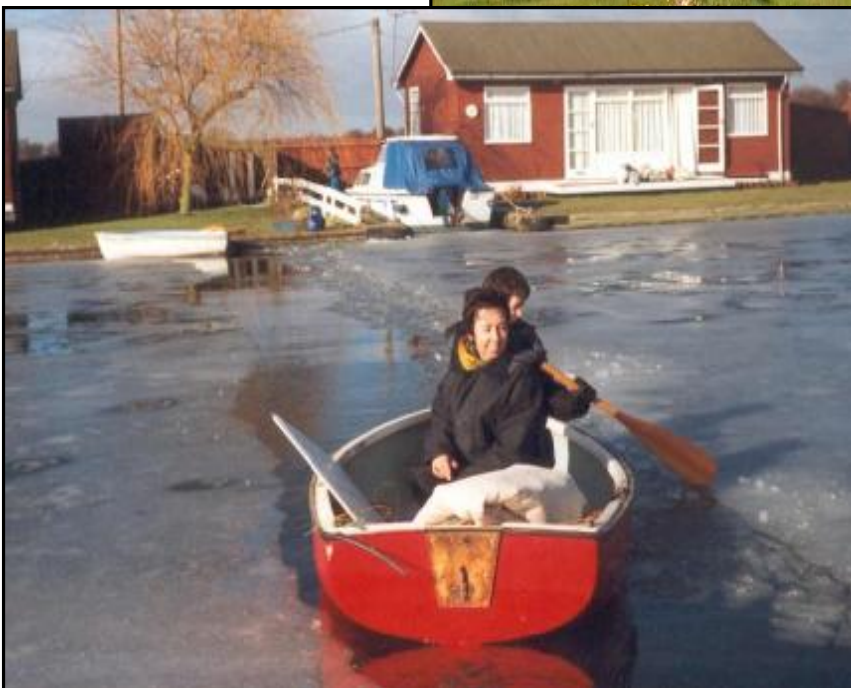
YOU GET NO TRAFFIC JAMS IN DECEMBER