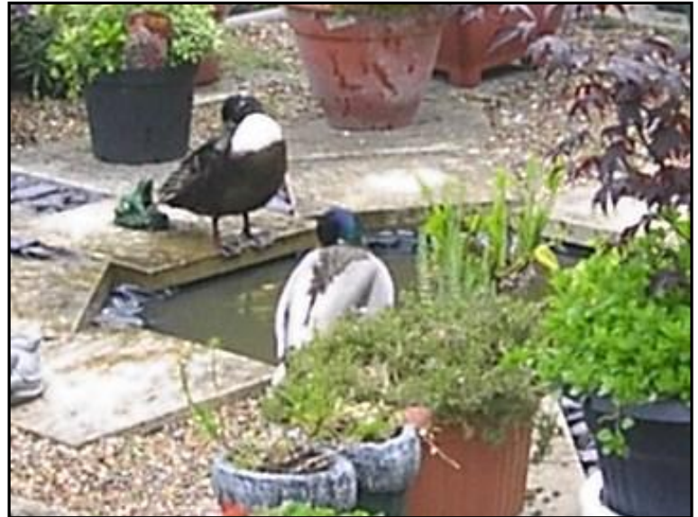
NO, I'M SORRY, I'VE BEEN USED TO SOMETHING MUCH BIGGER